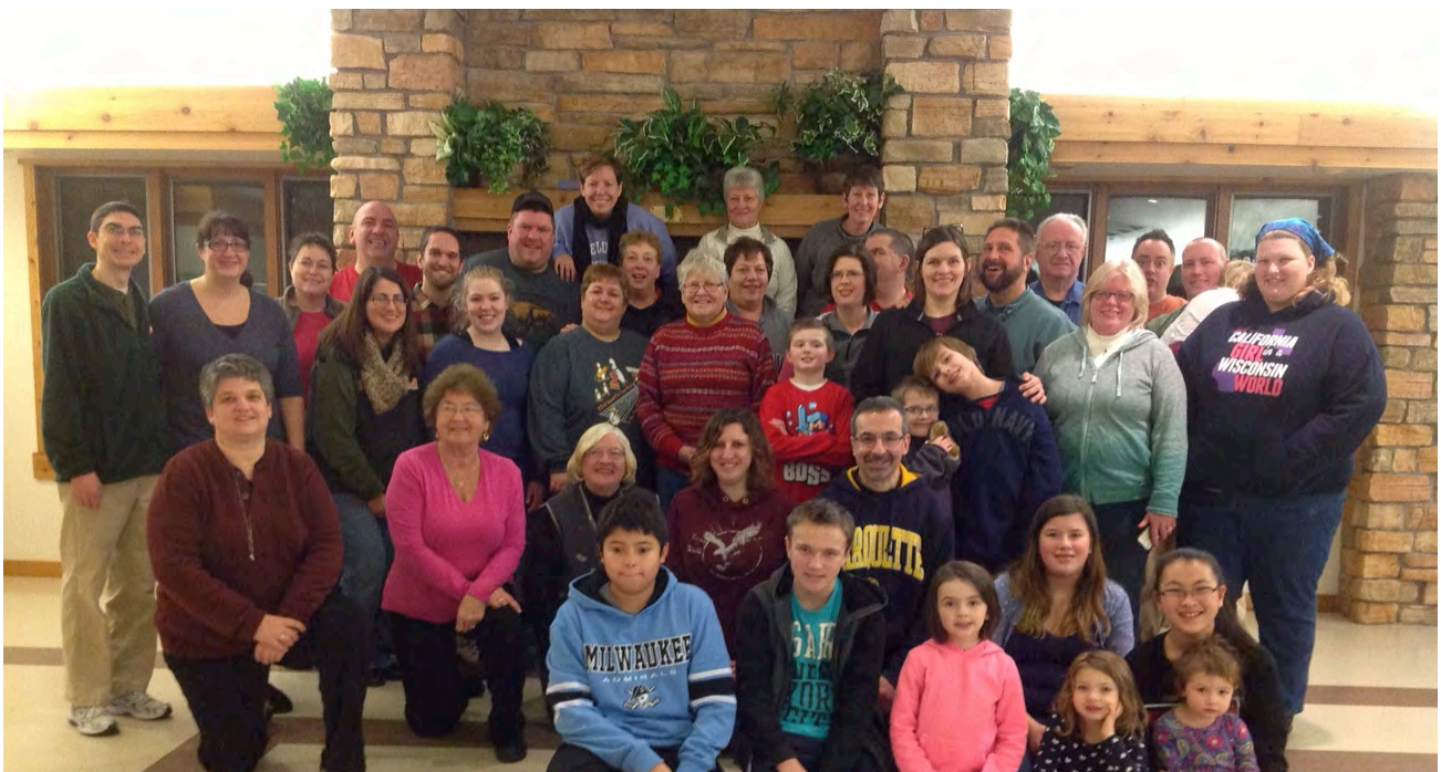
Winter Campers 2015